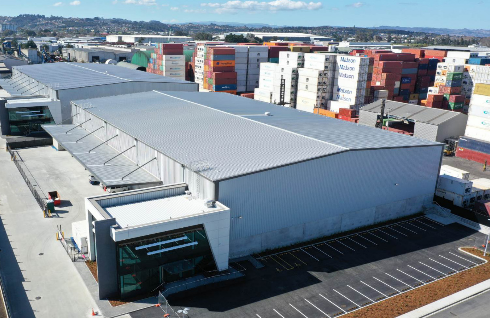
Oak Road development, Wiri, Auckland