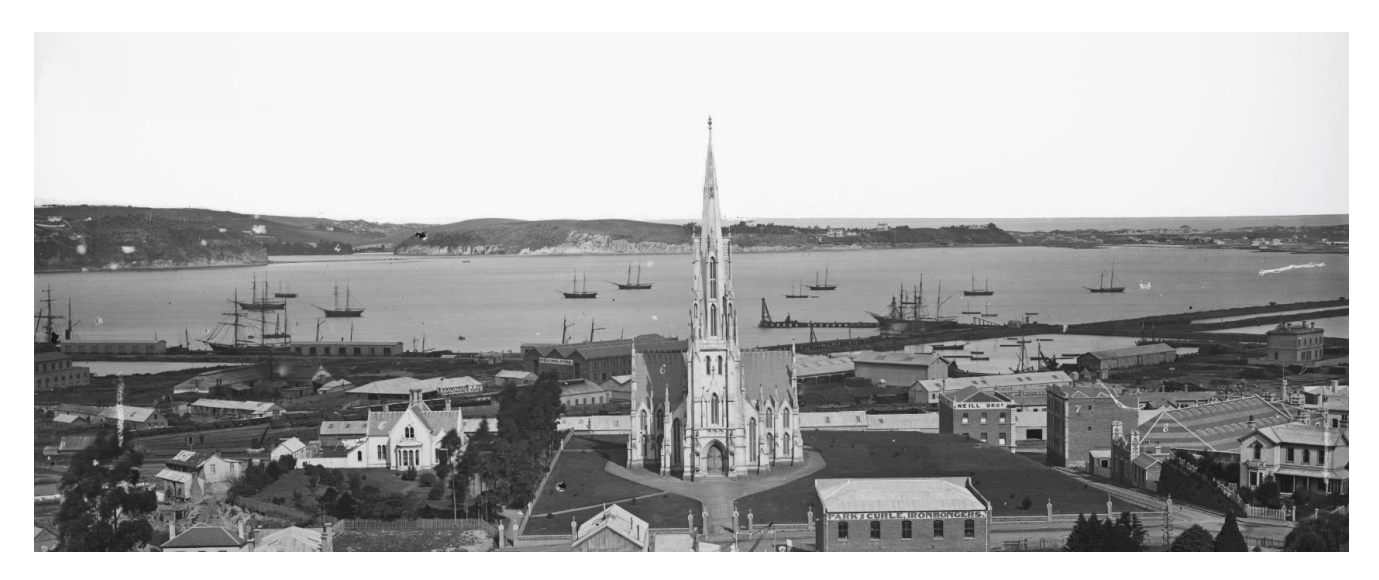
Harbour side shipping activity circa 1868